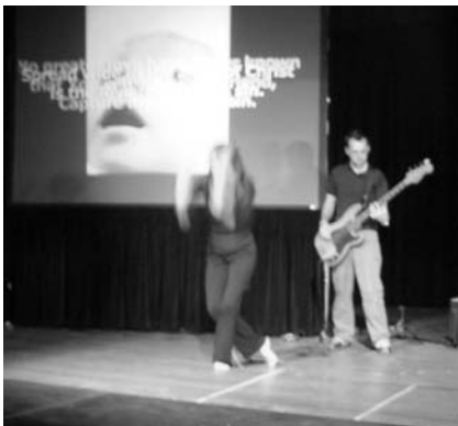
(Left) Expressing God's extravagant love

Our next Sabbath meeting is scheduled for Sunday, April 17, 2005. If you're in the area, make plans now to join us as we continue to celebrate God, life and each other with student ministries from across upstate South Carolina.